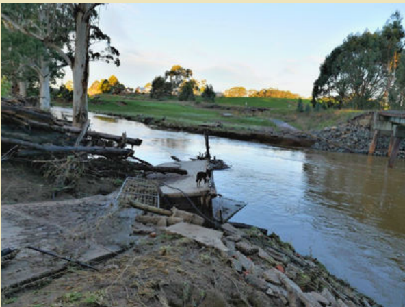
Dog 'Cactus' stands on what was once a bridge following the 2016 Inglis River flood at Flowerdale

Visit the Tasmanian State Emergency Service (SES) to see the Tasmanian flood maps to find out if your property is at risk of flooding. Use this information to get ready and reduce your risk.