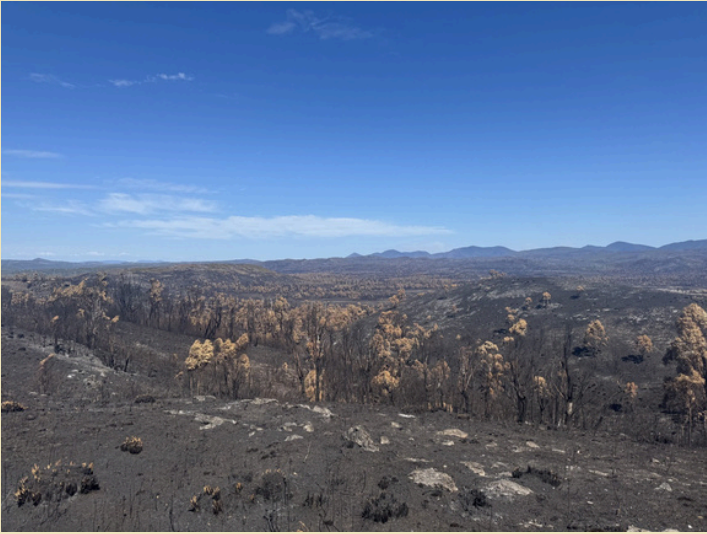
Aftermath of the February 2025 bushfires on Tasmania's West Coast