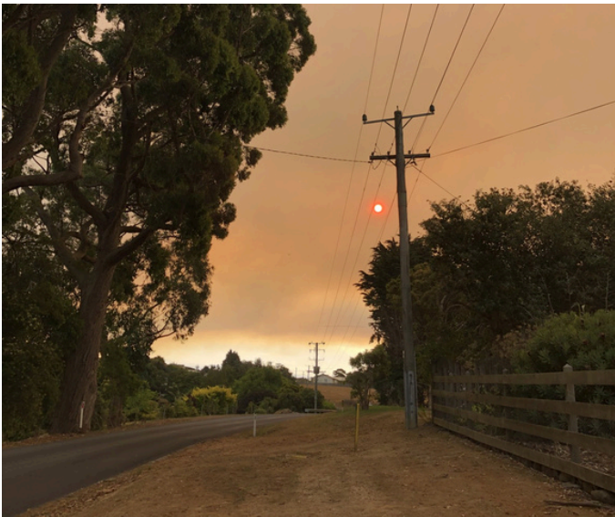
Smoky sky over a rural road

For more information, see the TFS Machinery Operations Guidelines: A basis for safe work in dry vegetation.