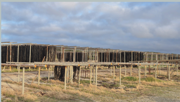
Kelp drying on King Island