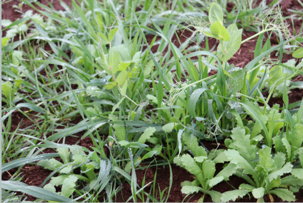
Diverse species in a multi-species cover crop encourage nutrient cycling.