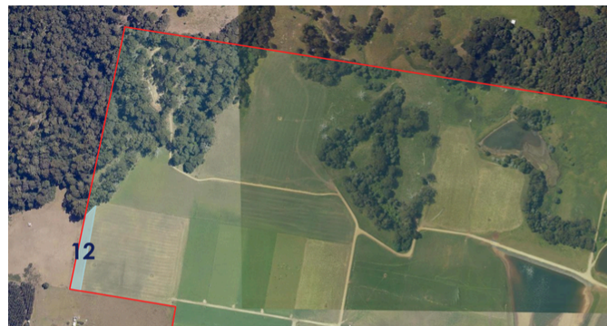
Map of proposed activity area 12