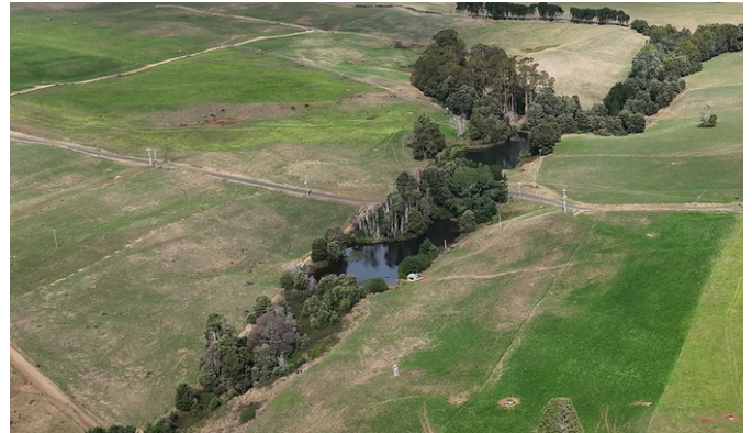
Drone captured photo of Main Tributary