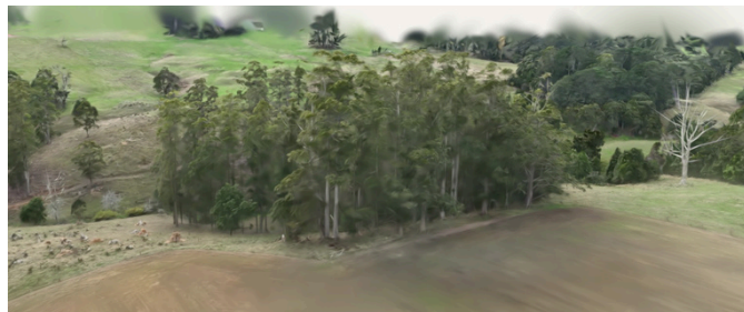
3D photogrammetry (drone captured) of proposed activity area 2

This area has been included in the baseline vegetation account with AFN.