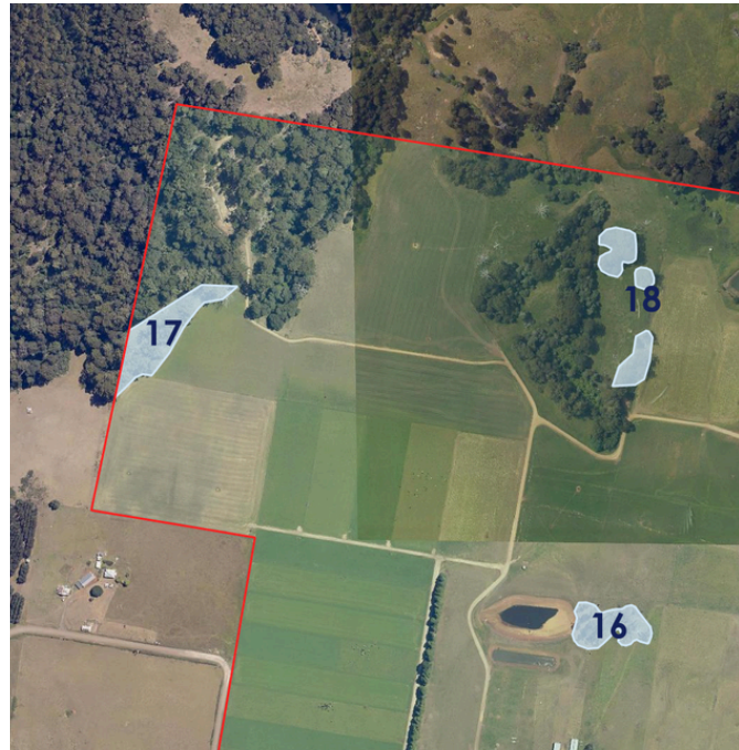
Map of proposed activity area 17