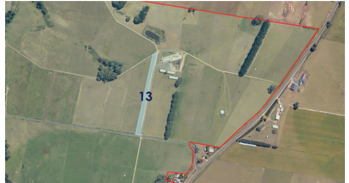
Map of proposed activity area 13