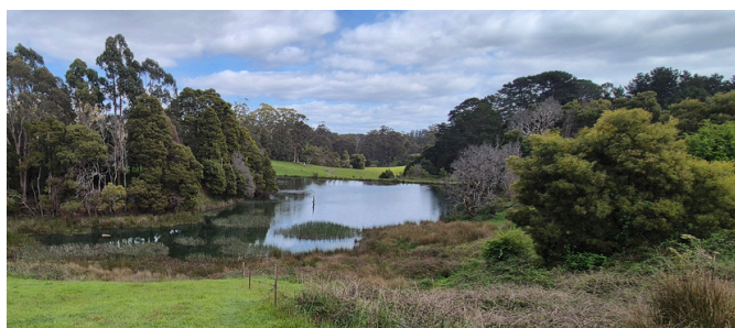
Vegetation surrounds many dams on the property

When: Initial natural capital data was gathered in February 2025. On-farm natural capital improvement actions will be undertaken from early 2026 through to early 2028, when the condition of the farm natural capital will be again reassessed through the AFN framework. Communication and extension activities are being delivered throughout with the demonstration to be completed by June 2028.