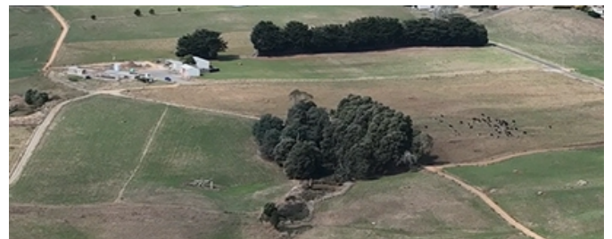
Drone captured photo of proposed activity area 13