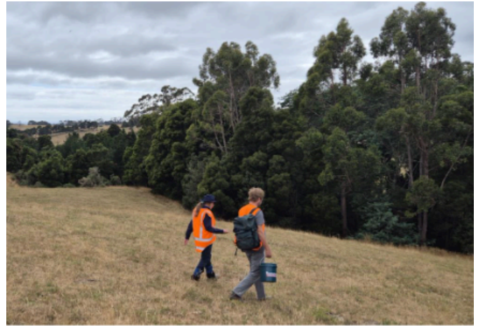
Data collection for the Natural Capital Account

This demonstration is being delivered by Cradle Coast NRM in partnership with the Tasmanian Institute of Agriculture (TIA) and supported by Fonterra and Dairy Tasmania.