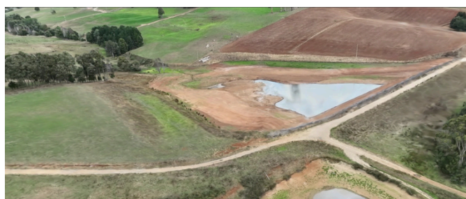
3D photogrammetry (drone captured) of proposed activity area 9

This area has been included in the baseline vegetation account with AFN.