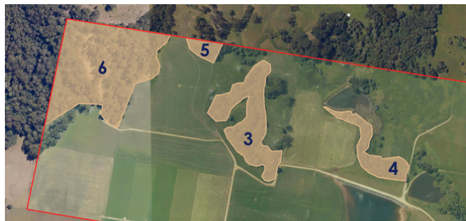
Map of proposed activity area 3

This area has been included in the baseline vegetation account with AFN.