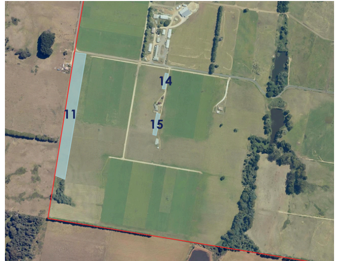
Map of proposed activity area 11