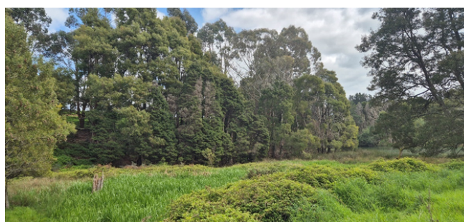
Vegetation at area 4