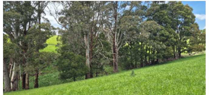
Vegetation surrounding the creek

This area has been included in the baseline vegetation account with AFN.