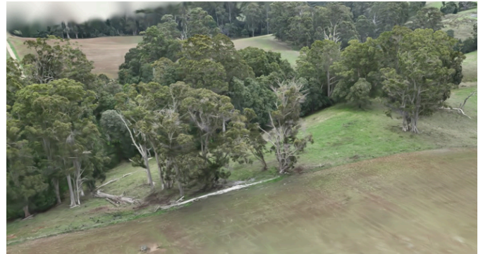
3D photogrammetry (drone captured) of proposed activity area 18

This area has been included in the baseline vegetation account with AFN.