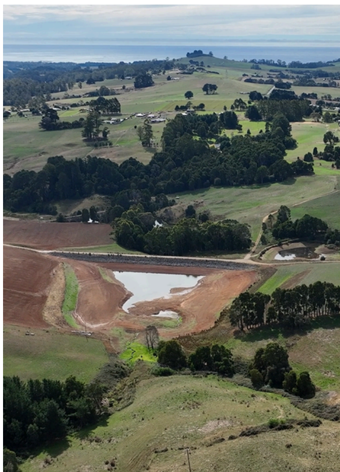
Drone captured photo of proposed activity area 9