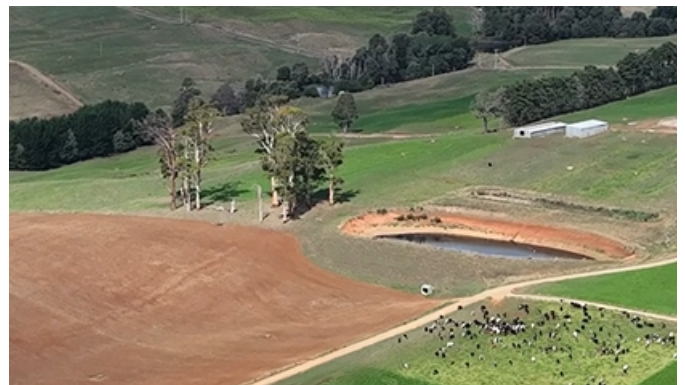
The paddock trees of area 16

This area has been included in the baseline vegetation account with AFN.