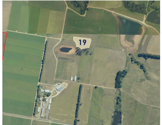
Map of proposed activity areas 19

This area has been included in the baseline vegetation account with AFN.