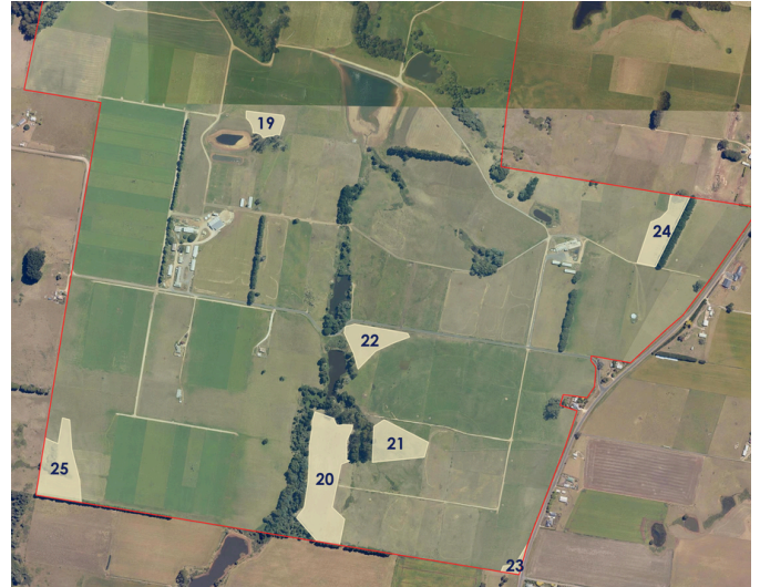
Map of proposed activity areas 20 to 25