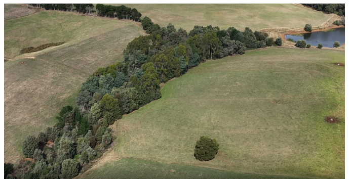
Drone captured photo of proposed activity area 6