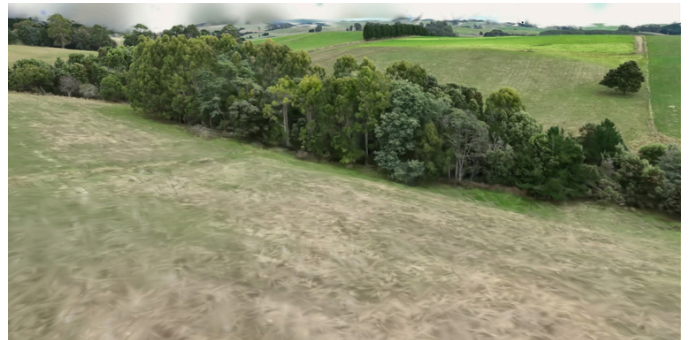
3D photogrammetry (drone captured) of proposed activity area 6

This area has been included in the baseline vegetation account with AFN.