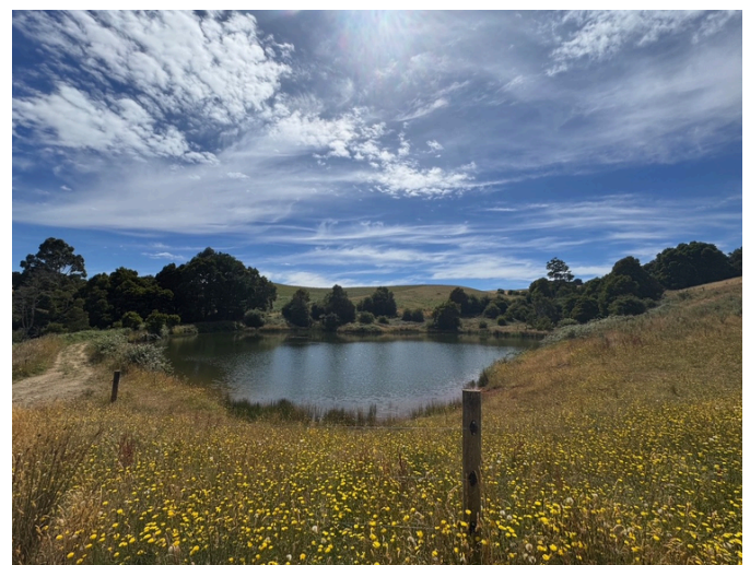
One of five dams across the TDRF