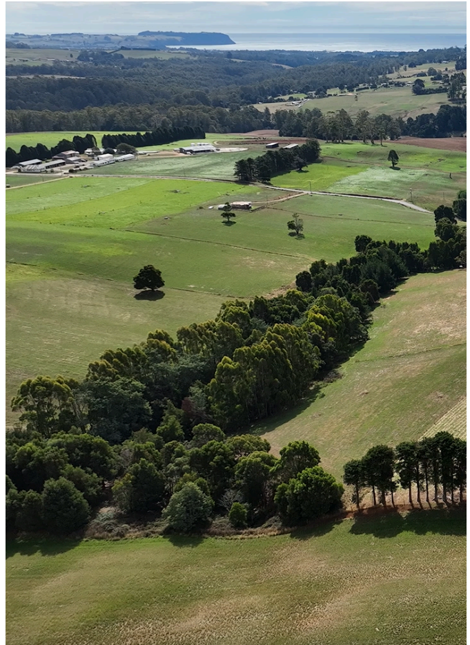
Image: Tributary vegetation at the TIA Dairy Research Facility

Cradle Coast NRM and TIA are seeking to maximise on the opportunities and outcomes of this demonstration and welcome collaboration and, as appropriate, financial investment in on-ground activities or extension opportunities going forward beyond the timeline of this demonstration.