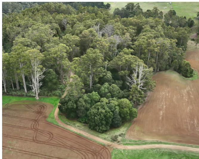
3D photogrammetry (drone captured) of proposed activity area 1

This area has been included in the baseline vegetation account with AFN.