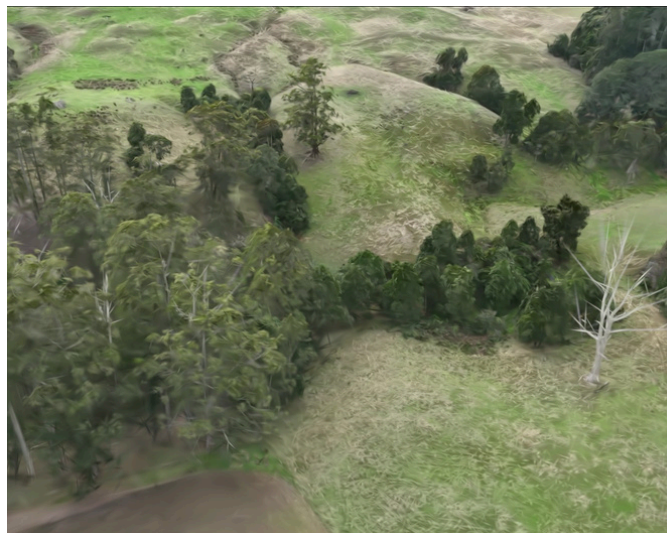
3D photogrammetry (drone captured) of proposed activity area 27

Proposed funding source: Cradle Coast NRM will pay for the weed control for year 1 and 2 through the Our Natural Advantage project.