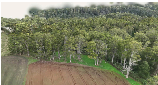
3D photogrammetry (drone captured) of proposed activity area 17

This area has been included in the baseline vegetation account with AFN.