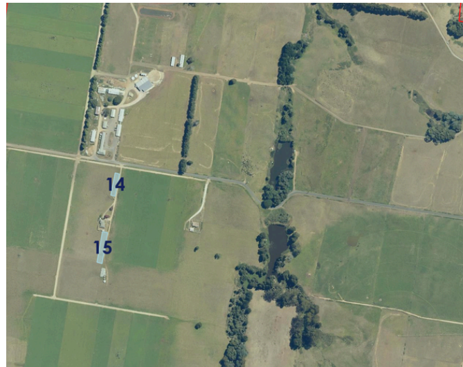
Map of proposed activity areas 14 and 15