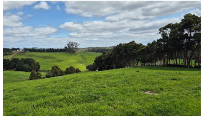
Looking down over area 10

This area has been included in the baseline vegetation account with AFN.