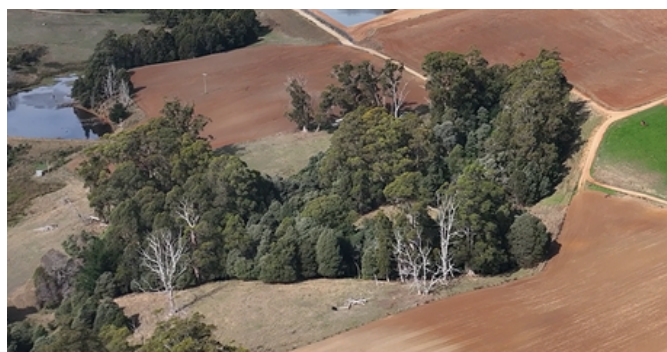
Drone captured photo of proposed activity area 3