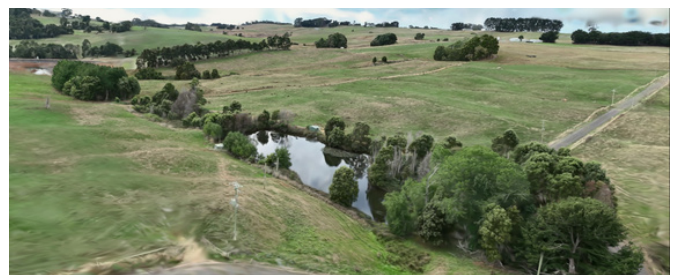
3D photogrammetry (drone captured) of proposed activity area 26