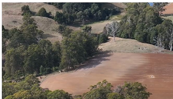
Drone captured photo of proposed activity area 2