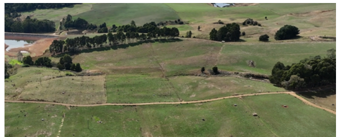
Drone captured photo of proposed activity area 10